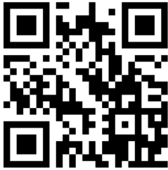
Video Step-by-step directions to set up Parent Observer