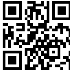
Video Step-by-step directions to observe additional students