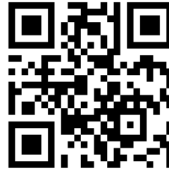
Written Step-by-step Directions for Parent Observer