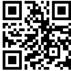
Video Introduction to Parent Canvas

Signing up to be a parent observer serves MANY purposes. Being an observer is a necessary tool to keep you informed on your student's academic progress. This is also a great way to partner with your student and student's teachers to ensure academic success. Scan the QR codes or enter the URLs provided for support on getting Canvas Parent Observer activated.